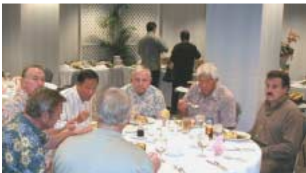
The crowd at lunch. How many can you identify?