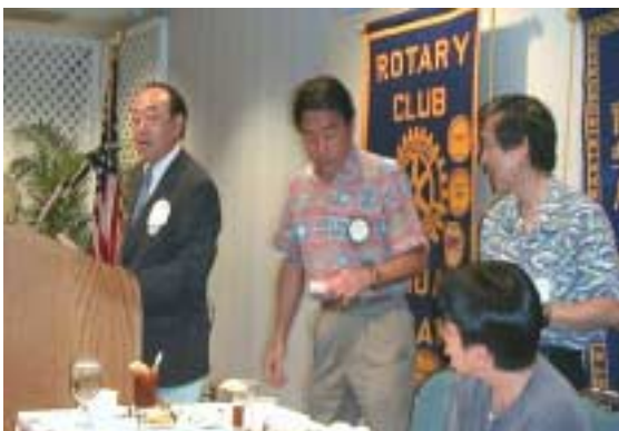
A visitor from Japan introduces himself to the membership