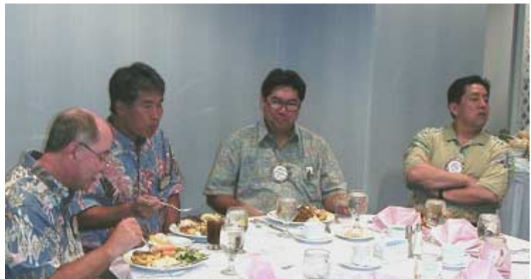
Another group of members at the luncheon