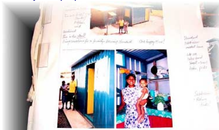
A happy Rotahome recipient with a "million dollar" smile.