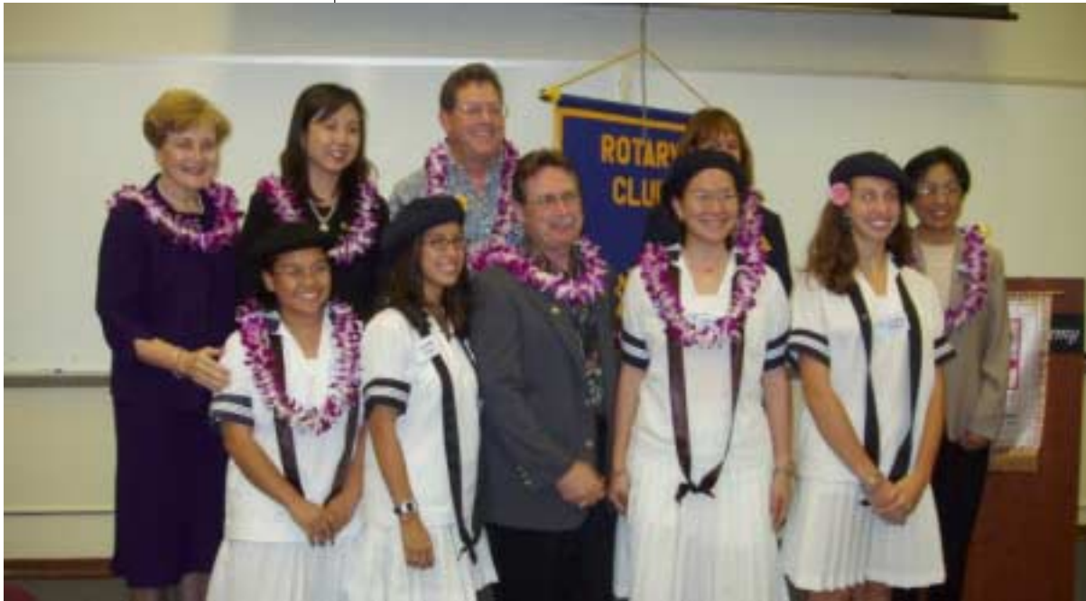
Rotary and Interac Officials