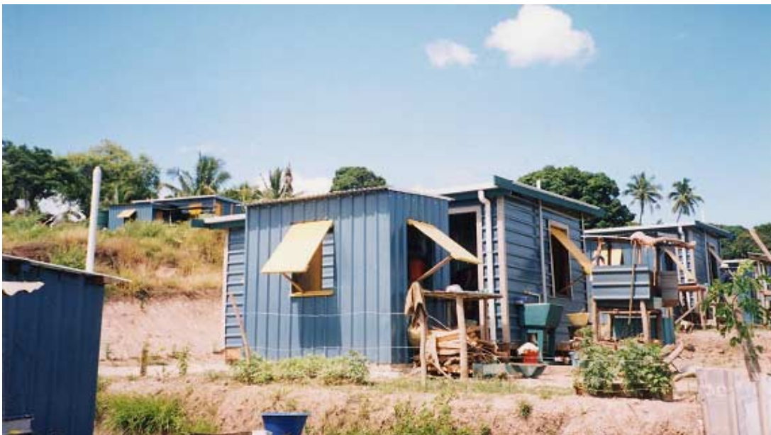
Fiji Rota home

Footnote : Our HBA Interact Club has been collecting empty printer ink cartridges to raise money for this project. As was previously requested, please collect your empty ink cartridges and give them to a New Generations committee member. The HBA Interactors would greatly appreciate this!