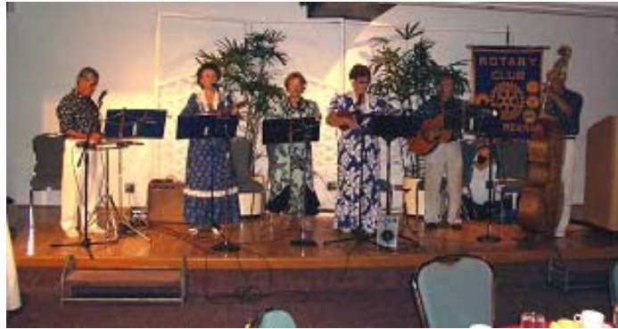
Entertainment was provided by the Stanton Group