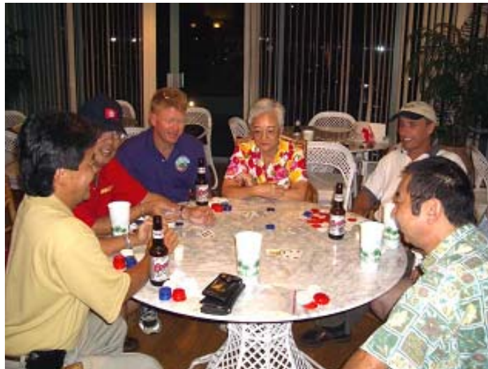
The Ala Moana Rotary poker gang.