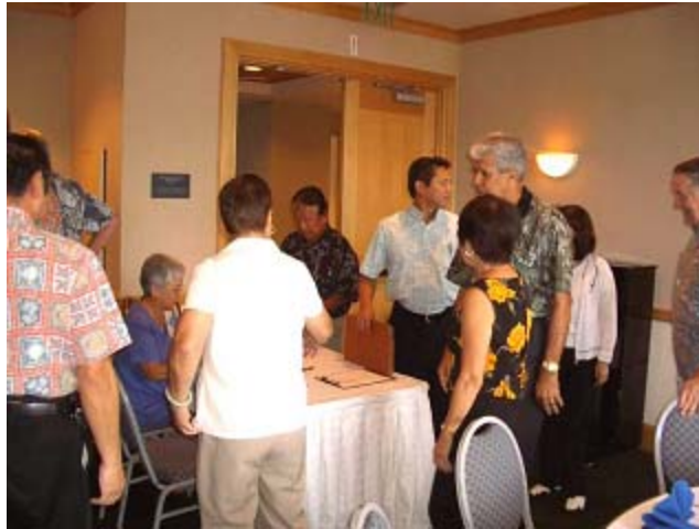
Ala Moana Rotarians arriving at the club assembly at the Japanese Cultural Center of Hawaii.