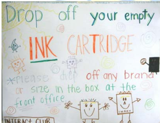
The sign from last year's HBA Interact Club's empty ink cartridge collection drive.

when he brought in a HUGE, HEAVY box of empty ink cartridges to today's meeting! Seriously, save those empty ink cartridges - HBA Interact will again be collecting these for their Heifer International Project. Last year, with a little assistance from our club, they purchased a cow for a needy family in a Third World Country.